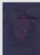
Alternative Subdued Crest