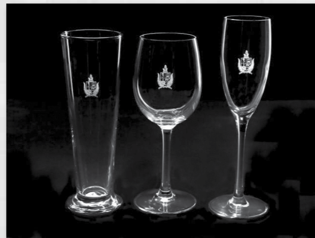
College glasses available from College Shop. Beer / Pilsner 13oz. Still Wine 11¾ oz. Flute 5¼ oz.