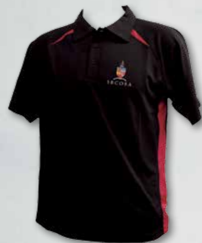
Dry Fit Style